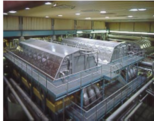
The Hedemora VDF Filter

Each disc is built up by 20 open-grid sectors connected to corresponding filtrate channels in the shaft. The open-grid sector design, with over